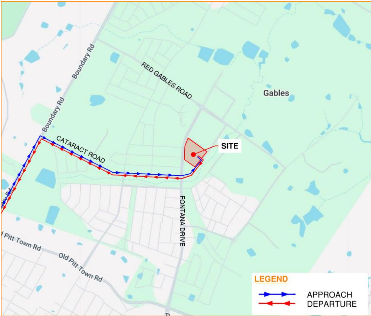
Figure 4: Truck Travelling Routes Near the Site