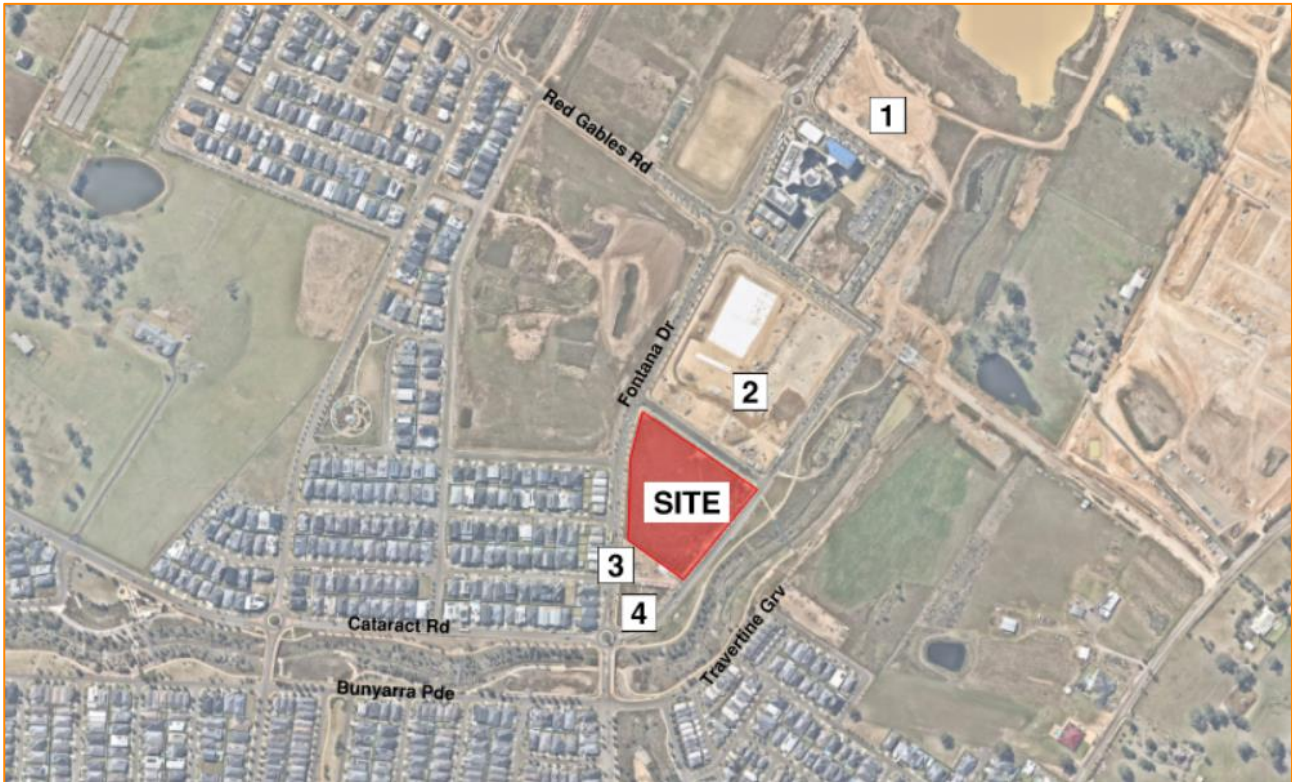
Figure 5: Neighbouring Construction Project

*The DA Number have been referenced from The Hills Shire Planning Portal Website