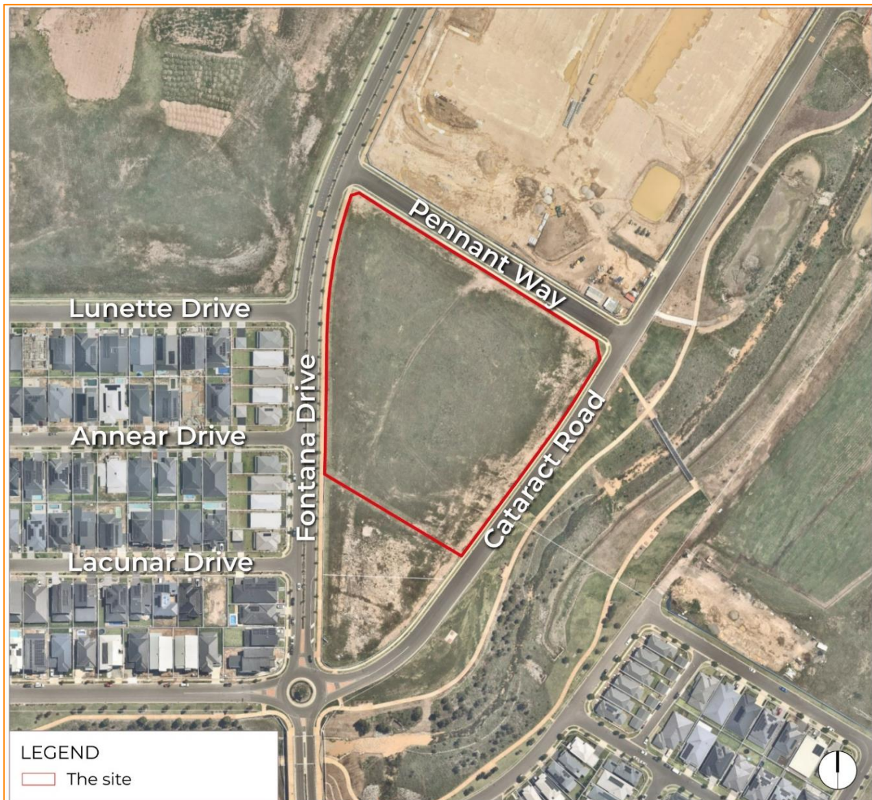
Figure 1: Site Aerial